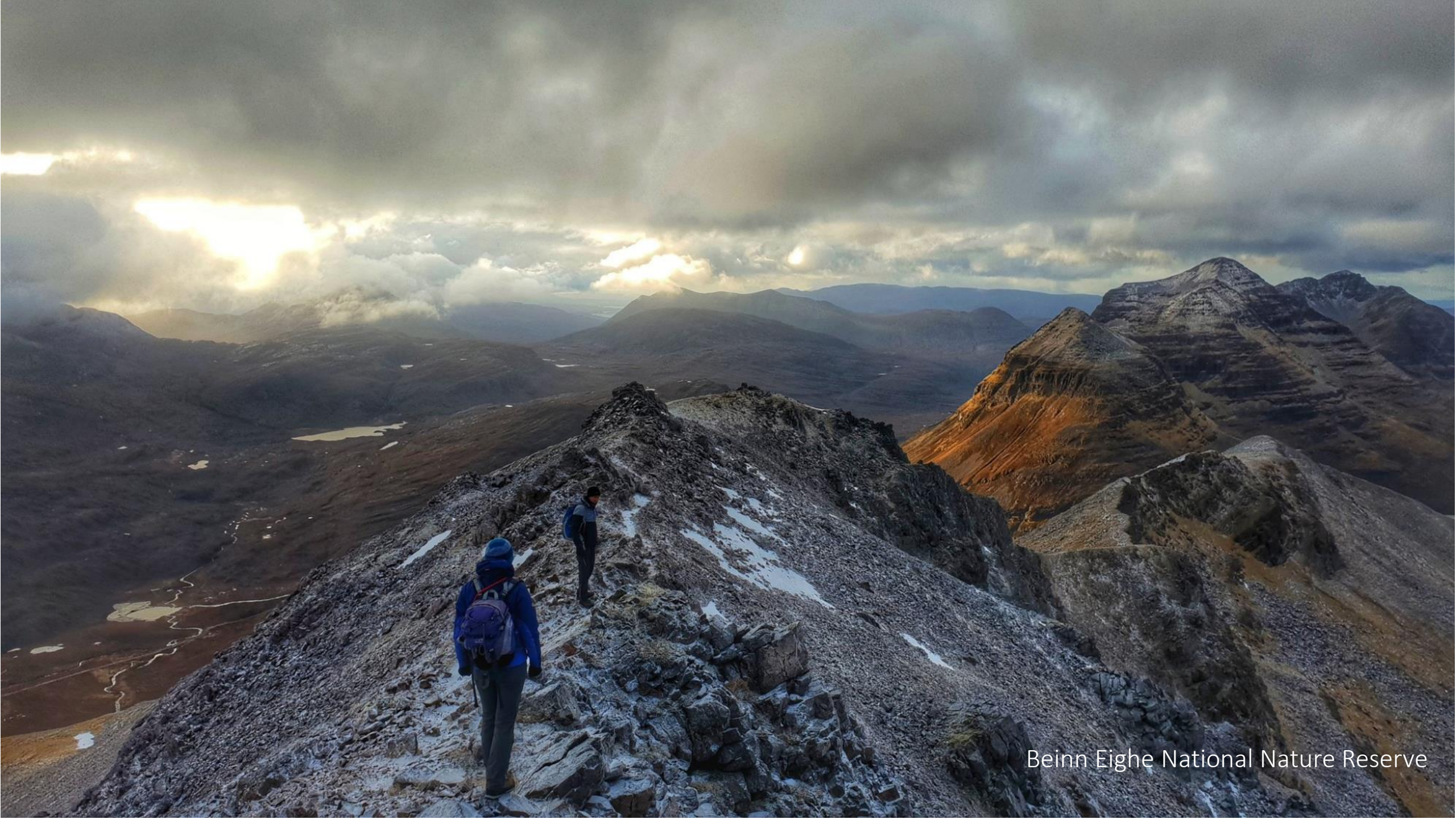
Beinn Eighe National Nature Reserve